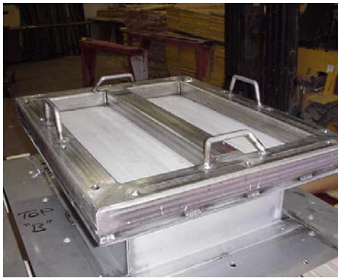
Custom Designed and Fabricated. Stainless Steel, High Pressure, Lift-off Access Hatch and Custom Frame.

Don't waste your time and money building your own hatches, let us give you what you want, when you want it.