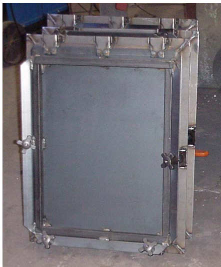
Modified Standard Access Hatch fitted with Spin-down Latching and reinforced hatch cover to take large material impact.