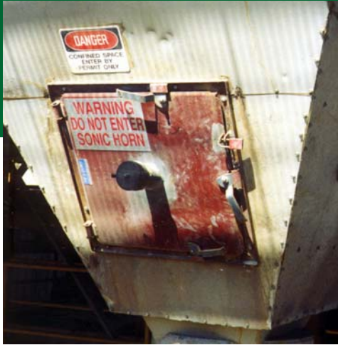
Access Hatch modified to accept Sonic Horn for a bulk solid material handling bin.