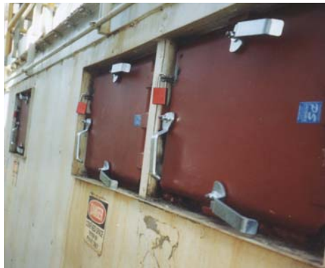
Standard Access Hatches with Hasp Locking Device.