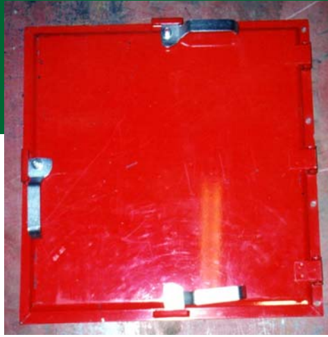
30" x 30" Standard Frame Access Hatch