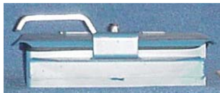
High Neck Frame for Special Applications