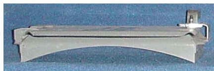
Frame with radius cut-out for Pipe/Duct Attachment or Curved Surfaces